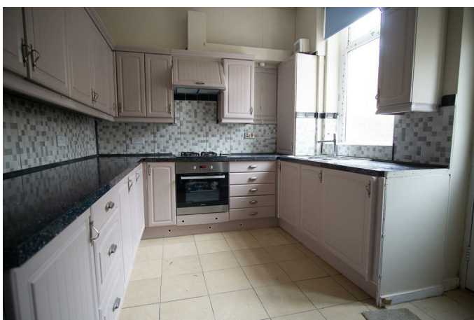
A family sized kitchen