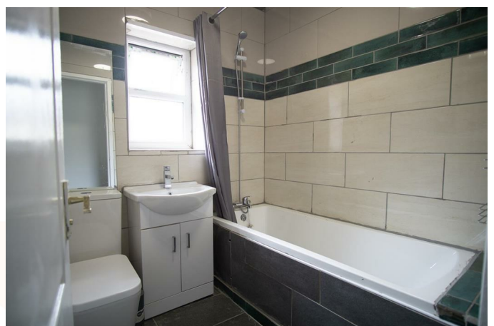
Bathroom with 3 piece bathroom suite