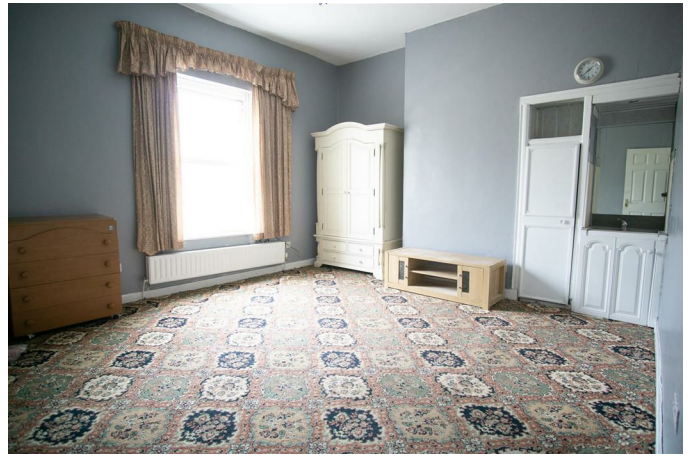
A main double sized bedroom