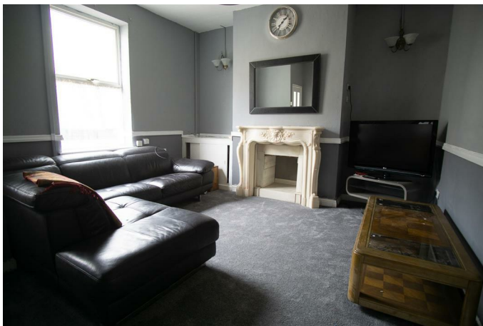
Main reception room upon entering the property