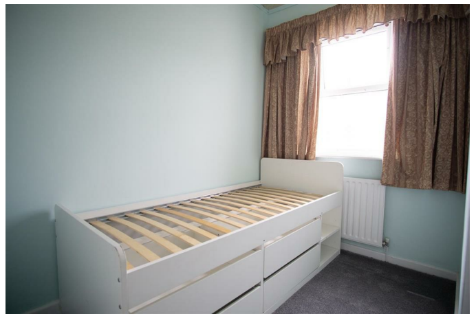
A single sized second bedroom