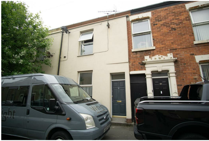
Located on Scotforth Road in Preston